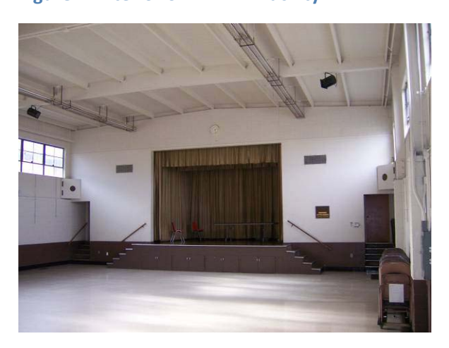
Figure 2 Interior of RWPRD Facility

In the past, the RWPRPD has rented its multi-purpose building for a range of classes, events, parties and other celebrations. There have been very few paid rentals in 2016; the District reported there were more non-paying events than paid events, which often did not adequately cover the costs for cleanup.<sup>5</sup>